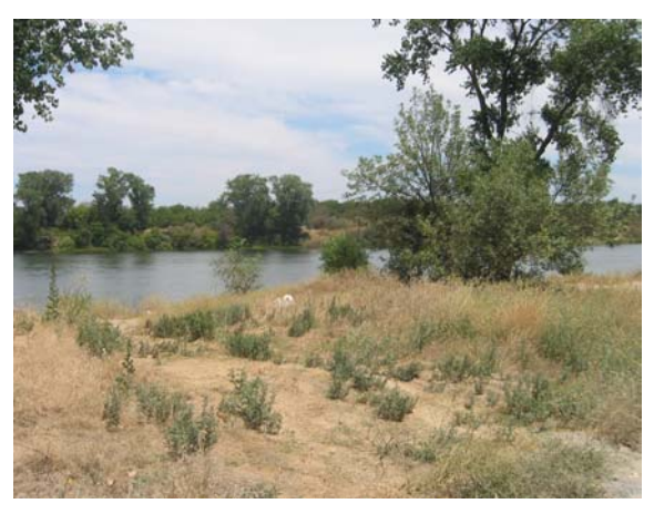
The creation and preservation of parks and open space are a key component of the General Plan.

their weekend days (and spend their weekend dollars). Coupled with the proposed Feather River Park, the overall park system in Yuba City will be significantly improved.