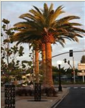
Downtown Plumas Street

Welcome to the City of Yuba City business community. This information guide is intended as a summary of information you will need to know in order to operate a business in the City of Yuba City. This guide is provided as a public service. It is not all-inclusive and any specific questions should be directed to the Business License Division at (530) 822-4619. Clarification and definition can also be found in the City of Yuba City Municipal Code, Title 3 – Finance Chapter 4. The City of Yuba City business license is not a regulatory license but is a tax to help pay for the public safety needs of the people of Yuba City.