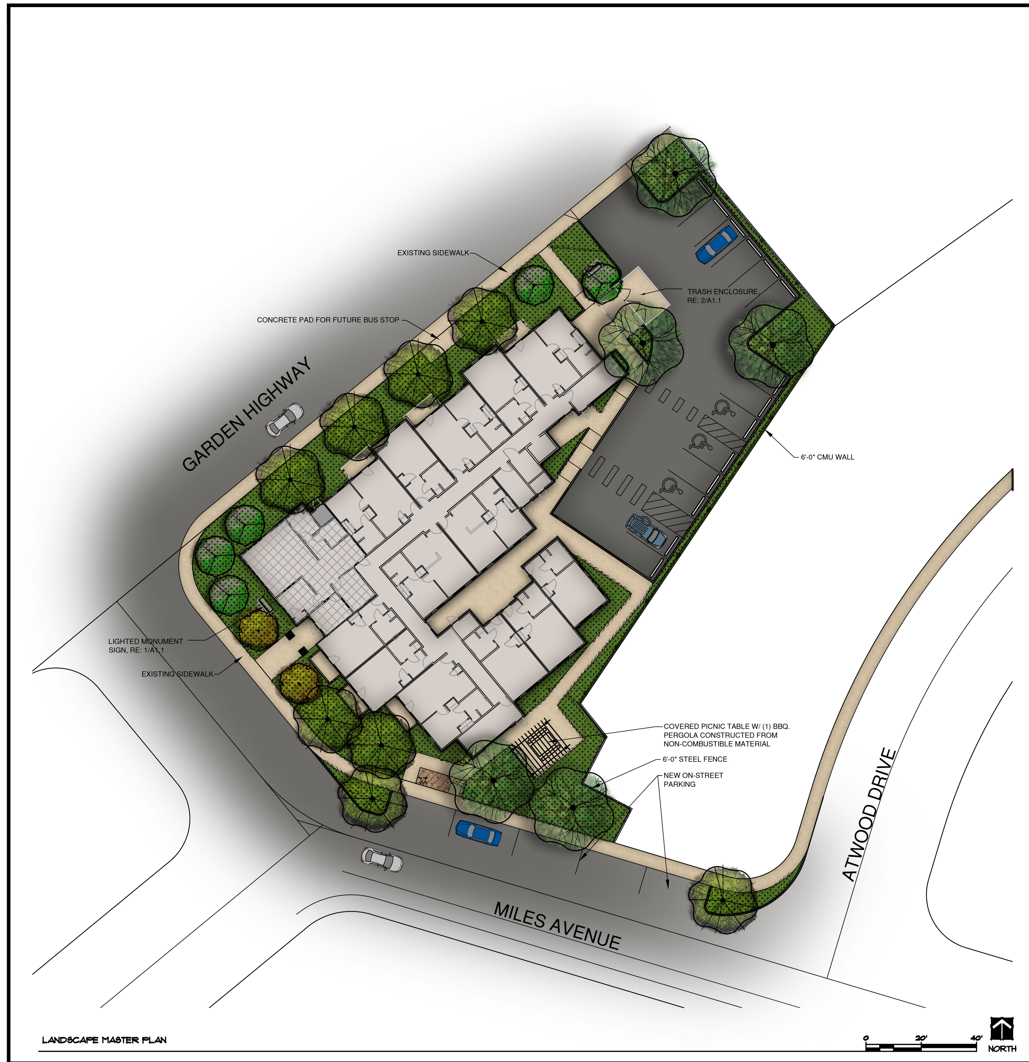
LANDSCAPE MASTER PLAN