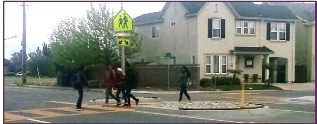
Flashing beacon on Franklin Road near Nantucket Way