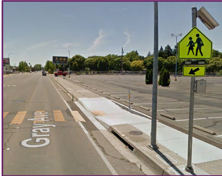
Flashing beacon at Gray Avenue and Forbes Avenue