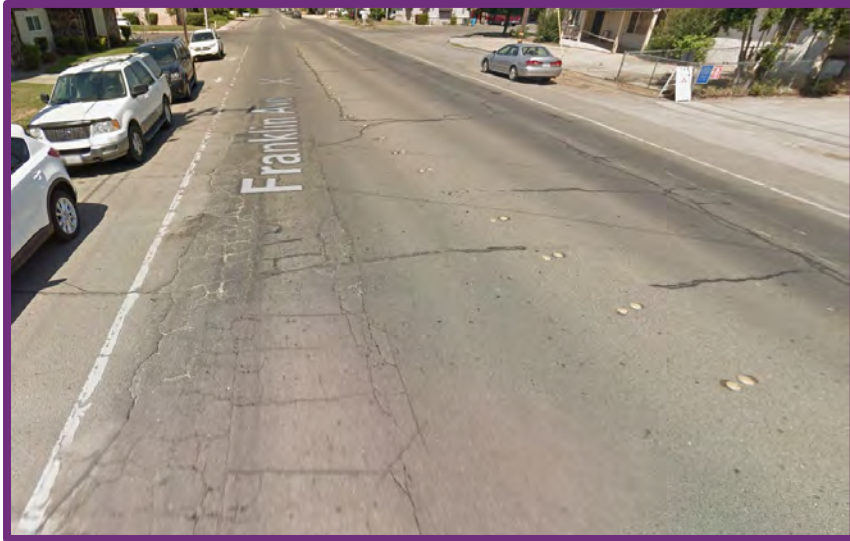
Location 1: Franklin Avenue – Palora to Gray Construction: Fiscal Year 19/20 (FY 18/19 $300,000 Programmed in CIP)