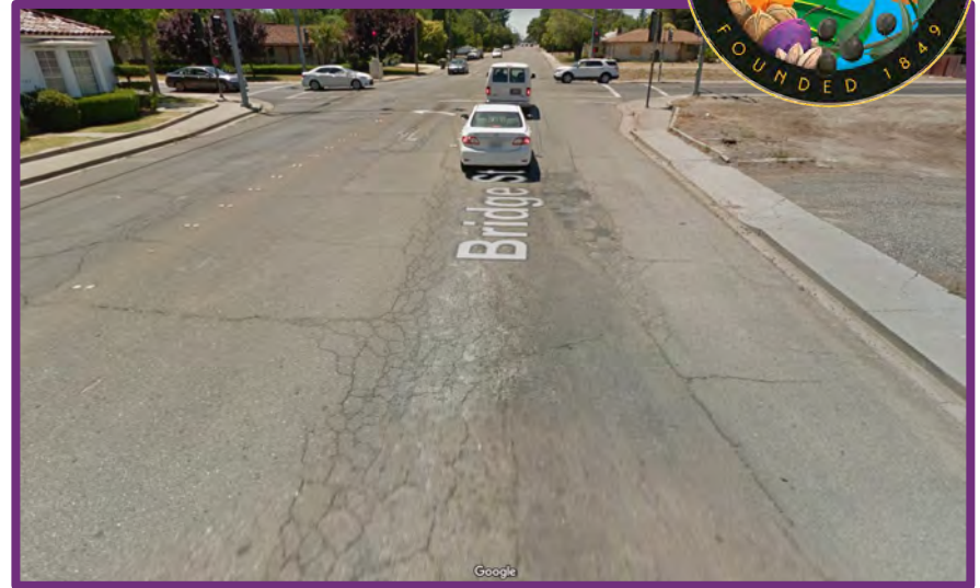
Location 2: Bridge Street– Gray to Cooper Construction: Fiscal Year 20/21