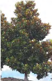
'Little Gem' Dwarf Southern Magnolia