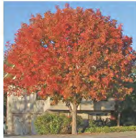
'Keith Davey' Chinese Pistache