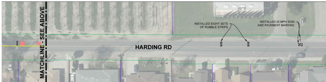
EXHIBIT A - AREA IMPROVEMENTS DRAWING CHERRY STREET AND HARDING ROAD