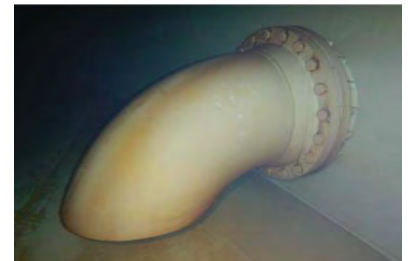
Rusted Effluent Line