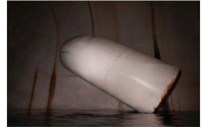
Rusted Influent Line