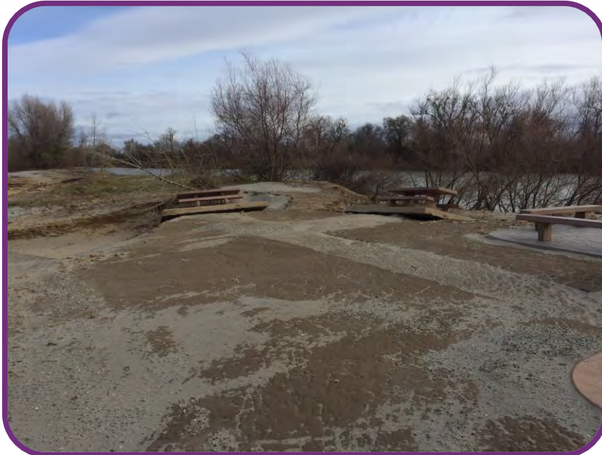
Figure 1: Table foundations undermined and debris scattered near Parkway's overlook area.