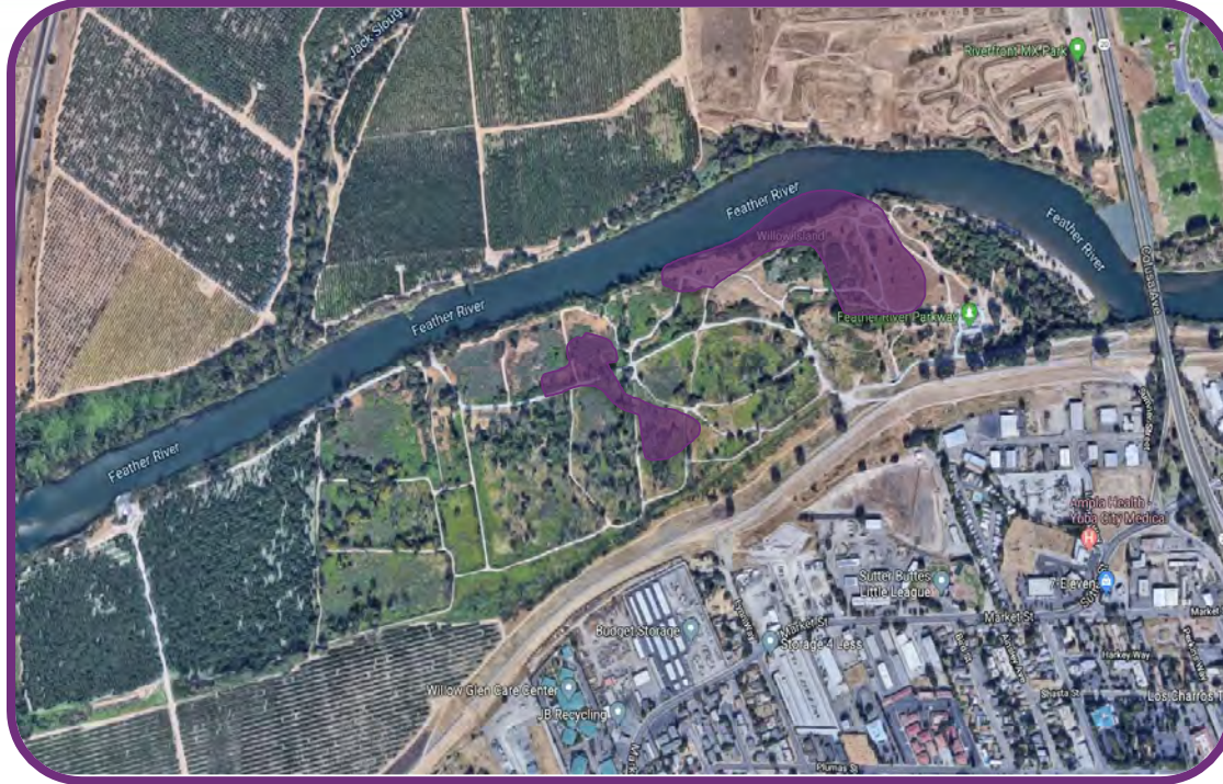
Figure 3: Project area map, with construction areas shown in a transparent purple color.