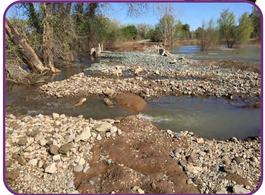
Figure 2: Area flooding near culvert crossing caused road and culvert failures.