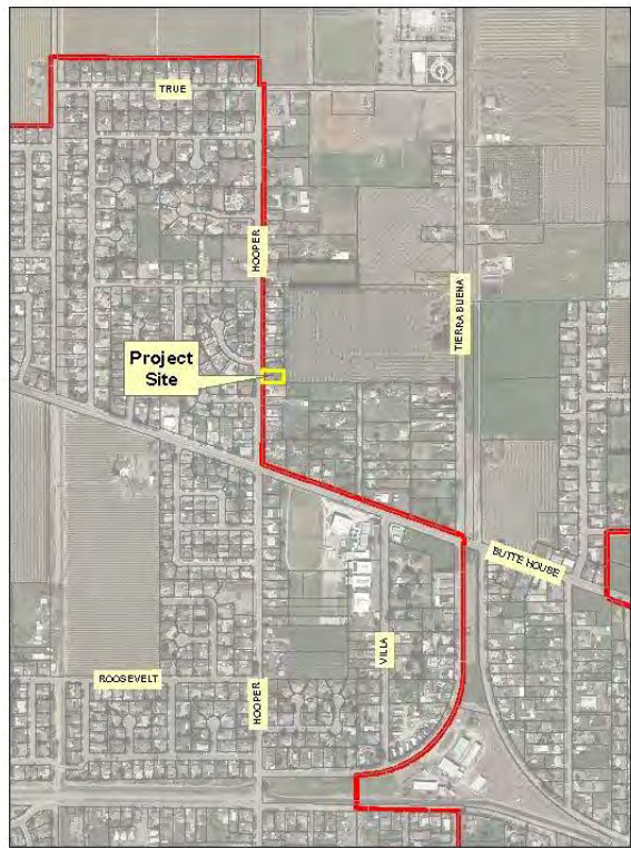
1993 Hooper Road