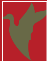
NEW POSITION Deputy PW Director – Engineering