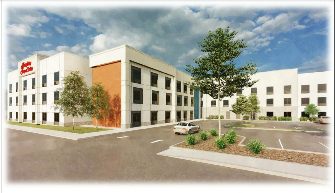
PERSPECTIVE (NEW BUILDING AT ANNETTE WAY)