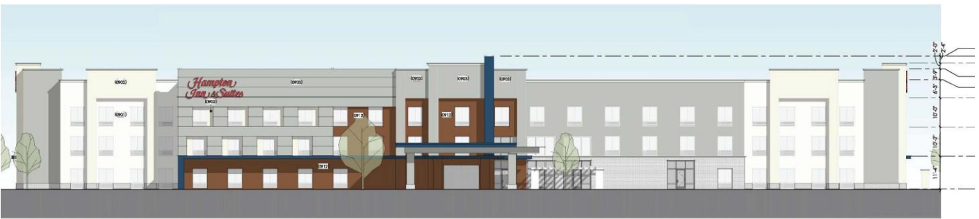
REMODEL - FRONT (SOUTH) ELEVATION