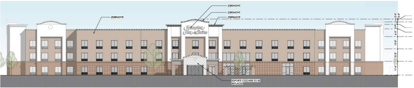
EXISTING - FRONT (SOUTH) ELEVATION