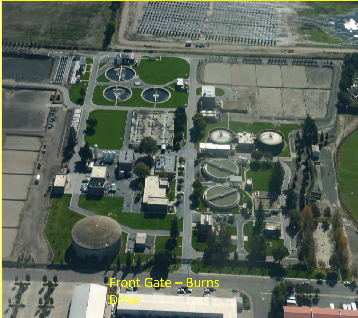
Front Gate – Burns Drive