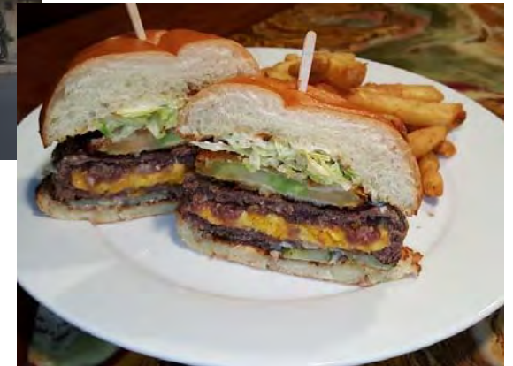
POPPIES APPAREL AND ACCESSORIES JUSTIN'S KITCHEN