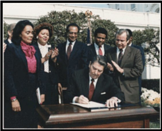
Ronald Reagan and Coretta Scott King at the Martin Luther King, Jr. Day signing ceremony

Soon after, the King Center turned to support from the corporate community and the general public. The success of this strategy was cemented when musician Stevie Wonder released the single "Happy Birthday" to popularize the campaign in 1980 and hosted the Rally for Peace Press Conference in 1981. Six million signatures were collected for a petition to Congress to pass the law, termed by a 2006 article in The Nation as "the largest petition in favor of an issue in U.S. history."