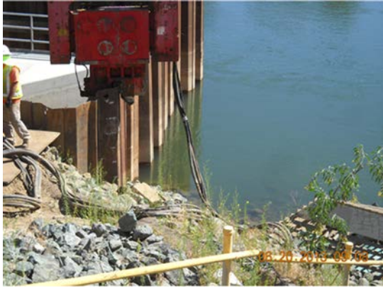
Starting to pull the first sheet pile